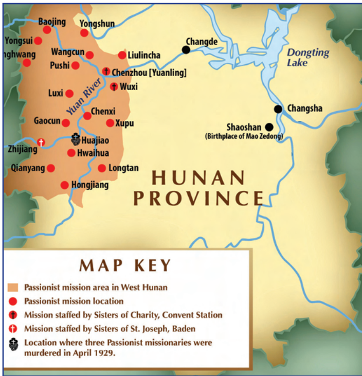
Hunan Province, China, showing Catholic missions.